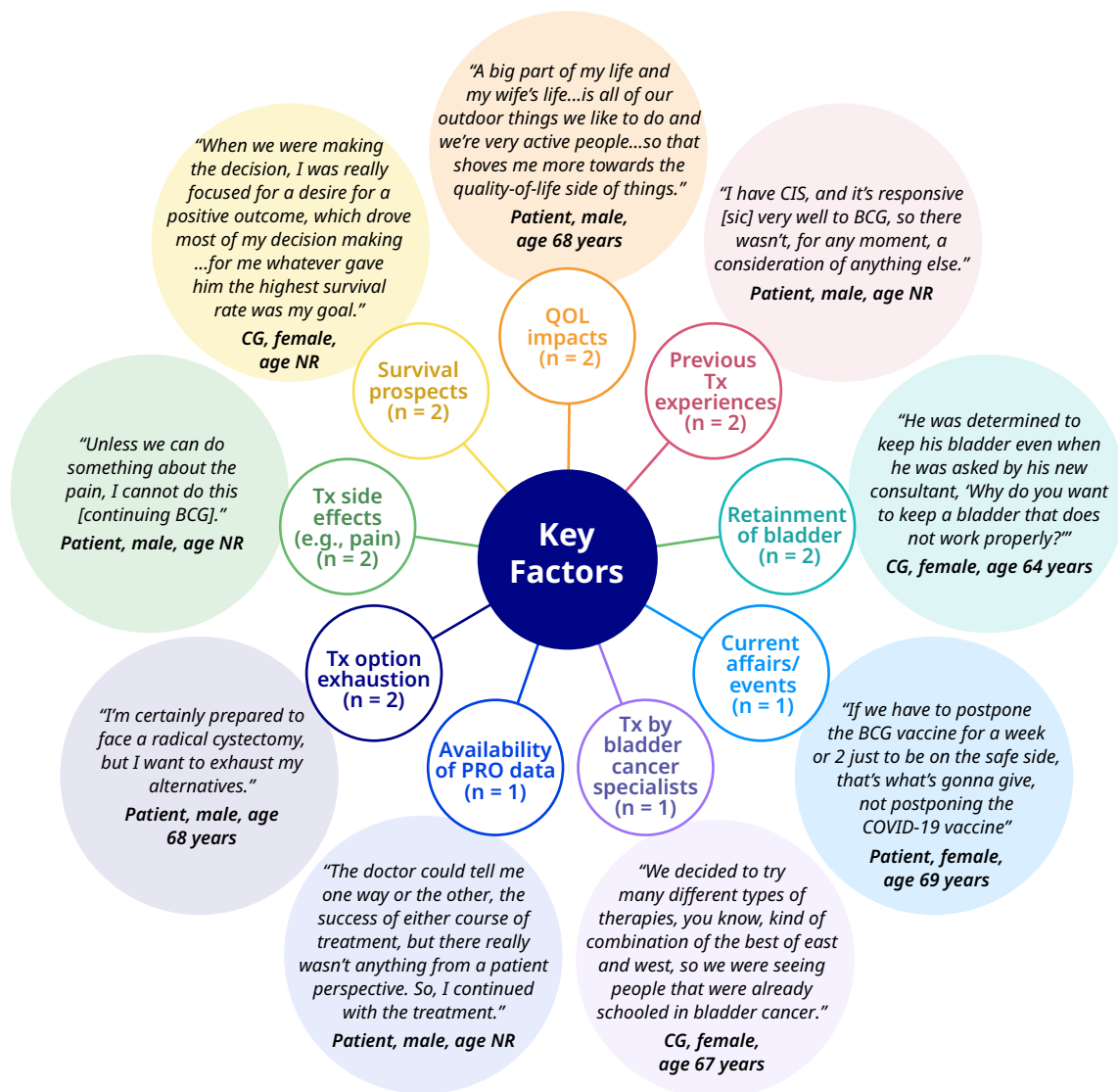
Supplemental Figure 3. Key Factors Considered Prior to Procedure and Treatment Decisions

PRO = patient-reported outcome; QOL = quality of life; TX = treatment.